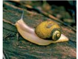
Green snail. DAF WA

Spread: By the movement of host plant material.