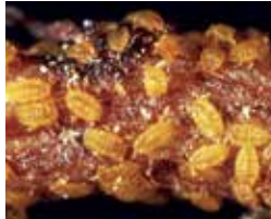
Phylloxera aphids.

Spread: By the movement of grapevine rootlings, equipment and soil from infested areas.