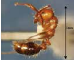
Red imported fire ant.

Spread: By the movement of infested materials such as pot plants, soil, mulch and timber.