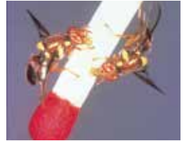
Queensland fruit flies. DEPI Vic

Spread: By the movement of uncertified host fruit out of infested areas. Most fresh fruits, including capsicum, chillies and tomatoes, are fruit fly hosts.