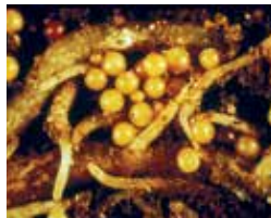
PCN-infested potato roots. DEPI Vic.

Spread: By the movement of host plants or of soil attached to plants, bulbs, advanced trees or agricultural equipment.