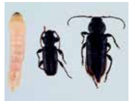
(L-R) EHB larva, male adult and female adult. DAF WA

Spread: By the movement of infested host timber, including building materials, wooden pallets and pine furniture.