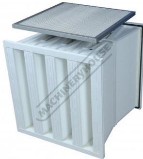
Pre Filter & Hepa Filter System