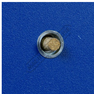
Inlet Spark Arrestor