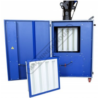
Dual H13 Hepa Filter