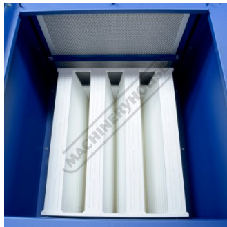
H13 Hepa Filter Assembly