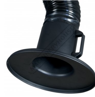
Fume Extraction Head