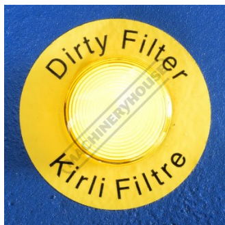
Dirty Filter Light Indicator