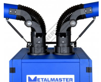
Dual Exo Joint with Gas Strut Supports