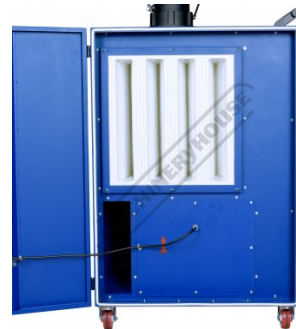
Left Side Door Access Panel