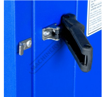
Quick Action Door Panel Locks