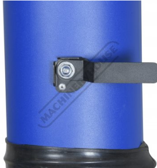
Air Flow Control Valve