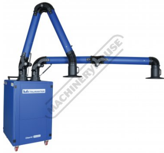
3 Metre Arm Extended