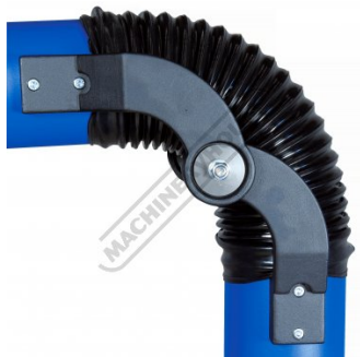
Exo Centre Arm Joint