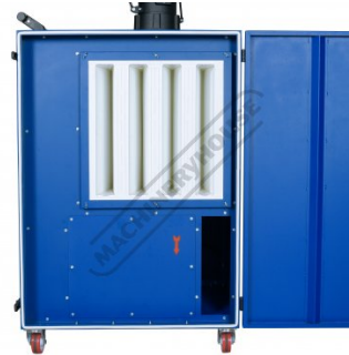
Right Side Door Access Panel