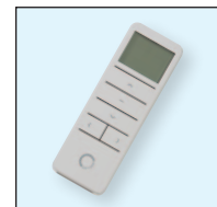
Optima 6 Channel Transmitter