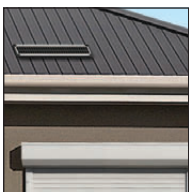
Roof Mounted Unit

The SolarSmart™ Plus Unit is best positioned on the roof (facing north and in direct sunlight) for optimum performance. The solar panels are a Monocrystalline type with excellent power output even in cloudy conditions. SolarSmart™ Plus Units (incl solar panels) are supplied with two brackets. All wires must be protected from UV radiation and weather with all drill holes well sealed. The SolarSmart™ Plus Unit may require future maintenance and/or replacement. This should be considered in difficult to reach applications like on the second storey of a building.