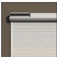
Unit to Pelmet*