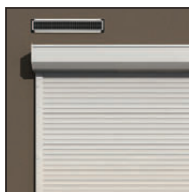
Unit to Wall*

* SolarSmart Plus units are only to be positioned on or above the roller shutter if in direct sunlight and facing north, with a minimum of half a day of sunlight in both Summer and Winter. Otherwise for optimum performance, SolarSmart Plus units should be positioned on the roof in direct sunlight and facing north where possible. If not enough direct sunlight, you may need to move the SolarSmart Plus unit to a north facing or ideal position, with available extension cables.