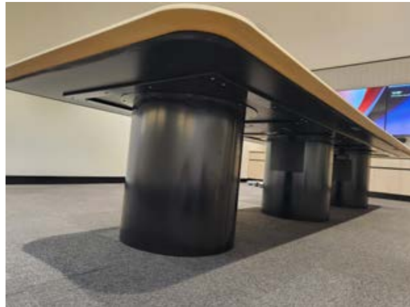
Cable access through hollow shell with hatch