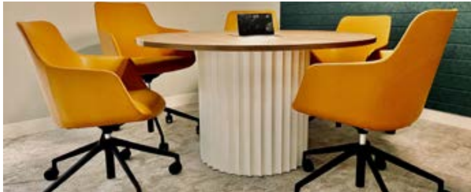
Concertina wrap design