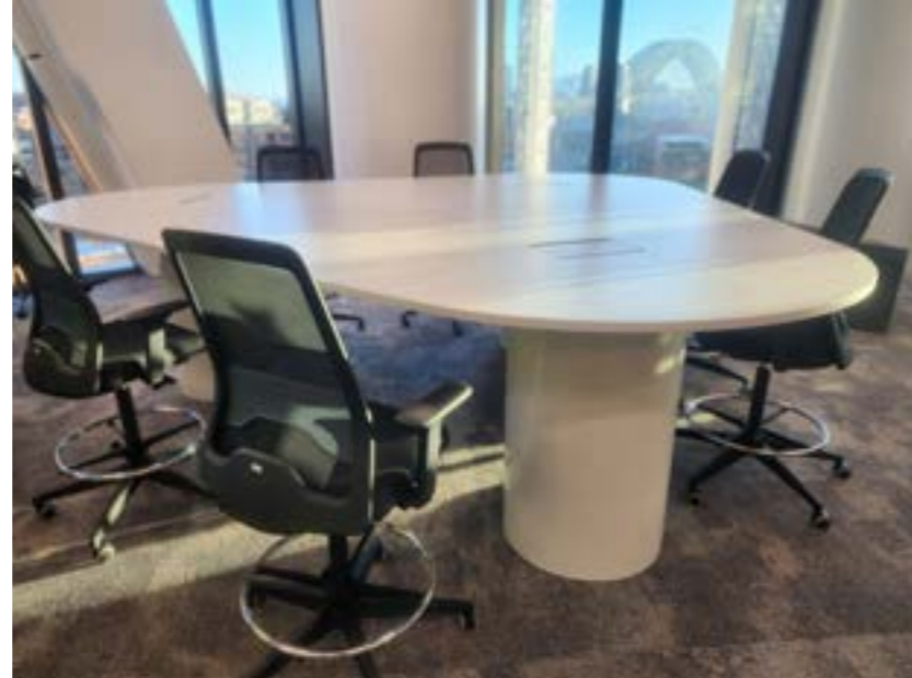
Custom designed shapes with matching laminate CMS power access