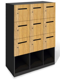
Triple Stack with Storage