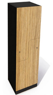
Step down Locker