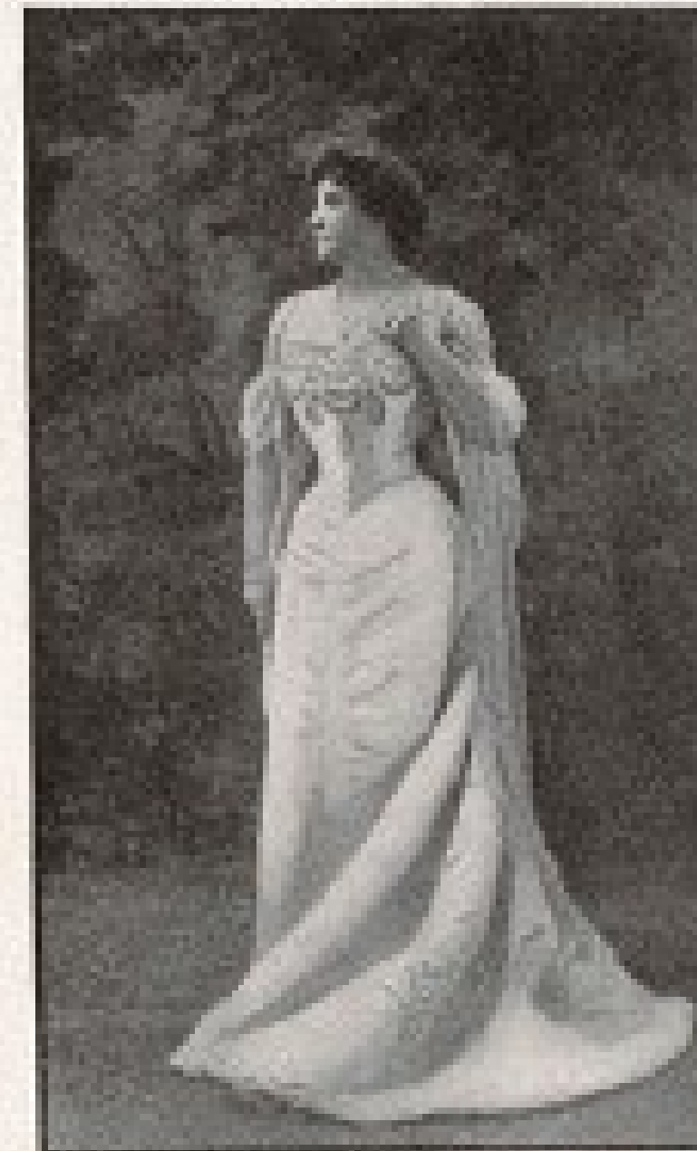
THE GREAT VOICED OF MADAME MELBA

IN APRIL LAST MADAME MELBA approached The Gramophone and Typewriter Ltd. with a view to obtaining a series of Gramophone Records of her singing in order that she might send them to her father in Australia. The Company agreed to take her to London to permit recording facilities and a laboratory fully fitted with the necessary machinery and apparatus was constructed in her honor in London. Madame Melba then spent her time there and made some 20 records in one or two days, but as the record is not yet ready for sale.