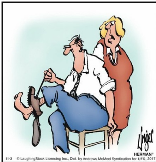
"Are they the new shoes you bought for $10?"