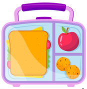
Recess and Lunch