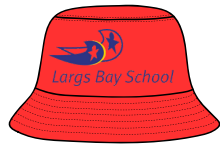
Red OSHC Hat