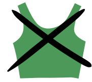
No Singlets or Crop Tops

Monday 13 th April - In House - Minute to win it - Today at OSHC, children will take part in our exciting Minute to Win It challenge! Children will rotate through a variety of fun, fast-paced one-minute games using everyday materials. The challenges are designed to build teamwork, resilience, coordination, and problem-solving skills – all while having lots of laughs.