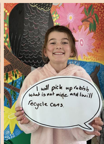
Some of the personal pledges made