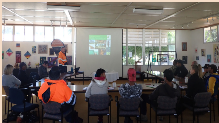
Green Card Training in Boddington

The practical component of the training involved effectively washing down and inspecting a vehicle to ensure that weed seeds and pathogens such as dieback are not being transported into sensitive bushland areas. Thank you to Joe and Josh from Terratree for travelling to Boddington to deliver the course and the Boddington Shire for allowing us to use their depot for the wash down demonstration.