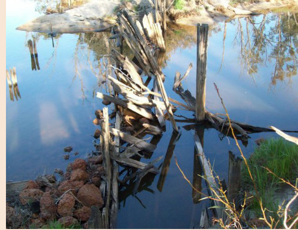
HRNR 3-Old weir.