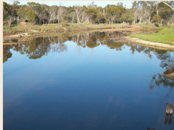
HRNR-Old weir.