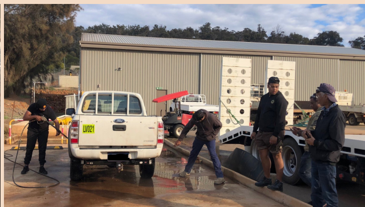
Vehicle wash down to remove soil and weed seeds