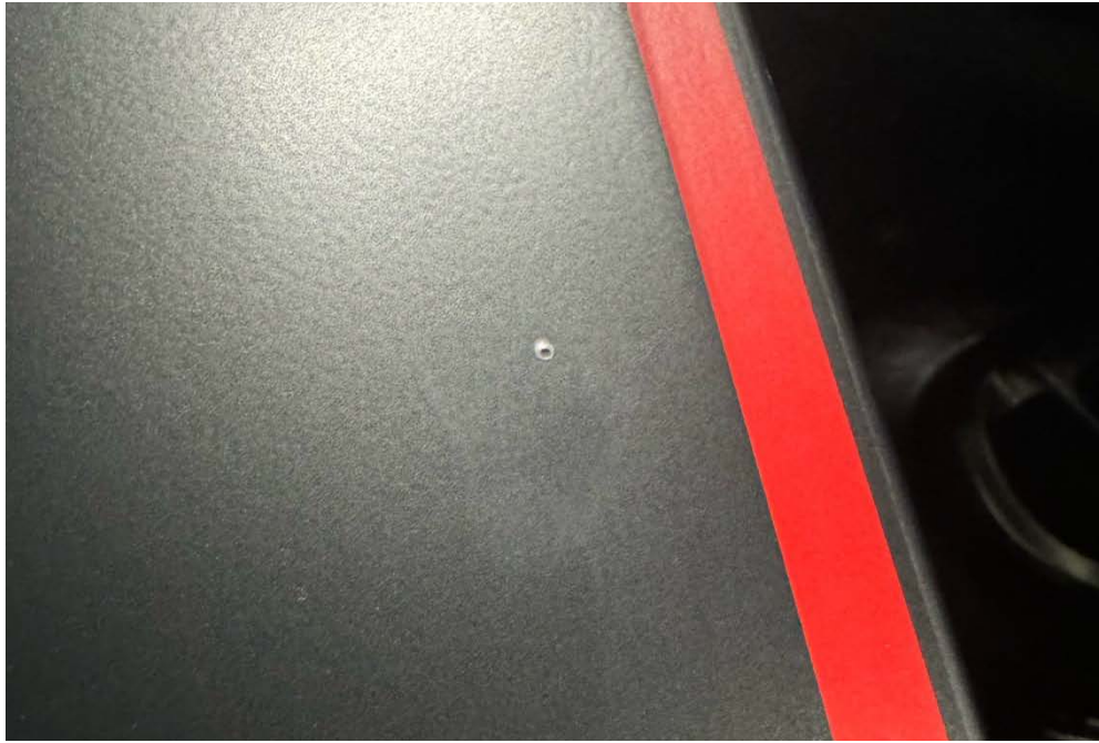
Paint defect: Dust nib trapped in the factory paintwork, film installed in this photo.