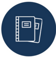
DELIVERING QUALITY TEACHING AND LEARNING