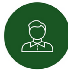
VALUING TEACHERS AND STAFF