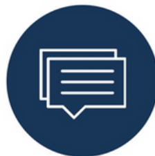
PARTNERING WITH PARENTS, FAMILIES, AND COMMUNITY