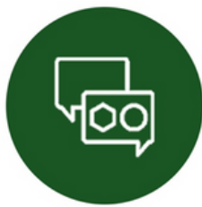
INCLUSIVE AND SUPPORTIVE