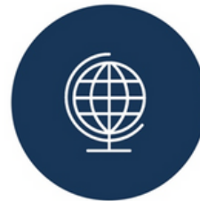
OPPORTUNITIES TO EXTEND