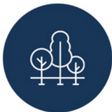
LEARNING BEYOND THE CLASSROOM (BEYOND4WALLS)