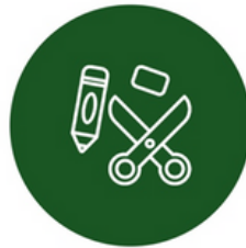
FLEXIBILITY IN LEARNING