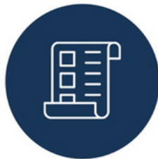
EVIDENCE IMPROVED PRACTICES