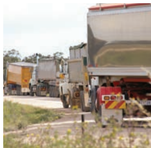
Figure 2. Major suppliers of UNIFORM treated fertiliser will add a red dye to avoid the risk of treated fertiliser contaminating augers or trucks.

UNIFORM is cream coloured hence it can be difficult to determine if fertiliser has been treated or not. Major suppliers of UNIFORM treated fertiliser will add a red dye so that it can be identified in comparison with untreated fertiliser. This is to avoid the risk of treated fertiliser contaminating augers or trucks, resulting in unintentional residues of fungicide in grain that may be transported in the same equipment. The dye also reduces the risk of confusion where both untreated, and treated fertiliser, are stored on farm.