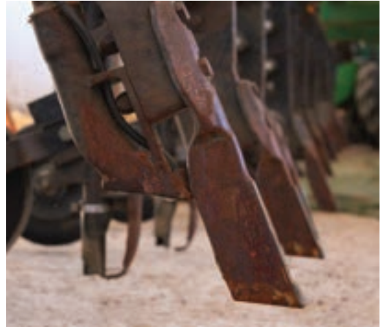
Figure 6: Sowing boot with liquid injection tube fitted.

UNIFORM should be thoroughly shaken before use. During trial work there were very few problems with compatibility, but care should be taken to ensure that liquid fertilisers mix easily with UNIFORM. If compatibility problems do occur, mixing UNIFORM with water in a 1:1 ratio before adding UNIFORM to the liquid fertiliser may overcome the issue. Liquid fertilisers containing phosphorus or sulphur are generally incompatible.