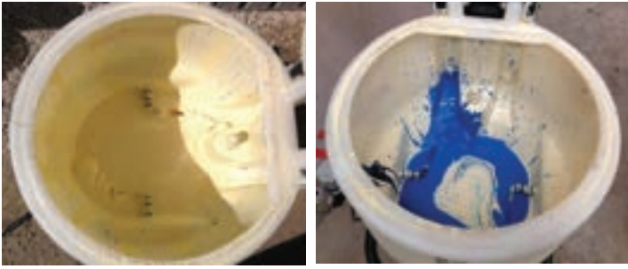
Figure 3: UNIFORM without dye in a mixing pot (left) and with blue dye added (right). Solutions must continue to be agitated while treating.