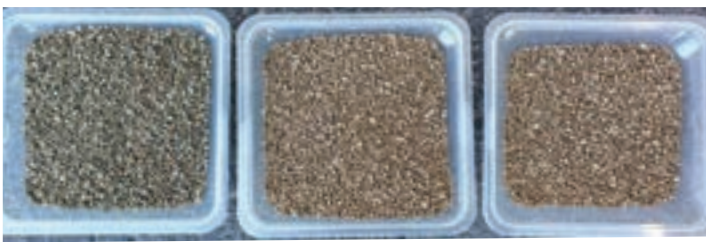
Incotec Blue Pigment UNIFORM Untreated