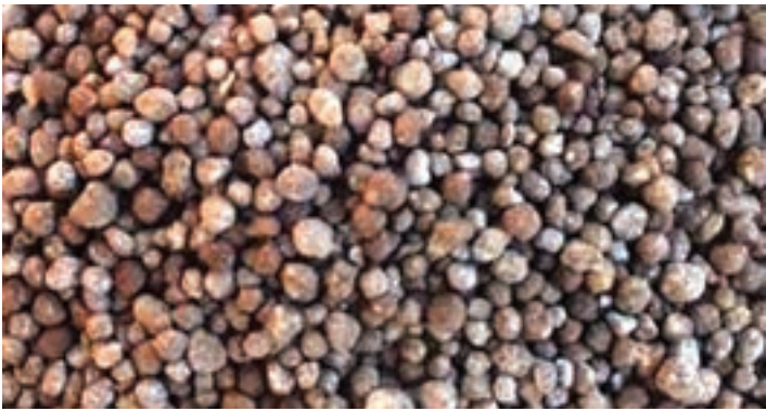
Figure 4: Fertiliser granules treated with UNIFORM plus red dye at 2 per cent.