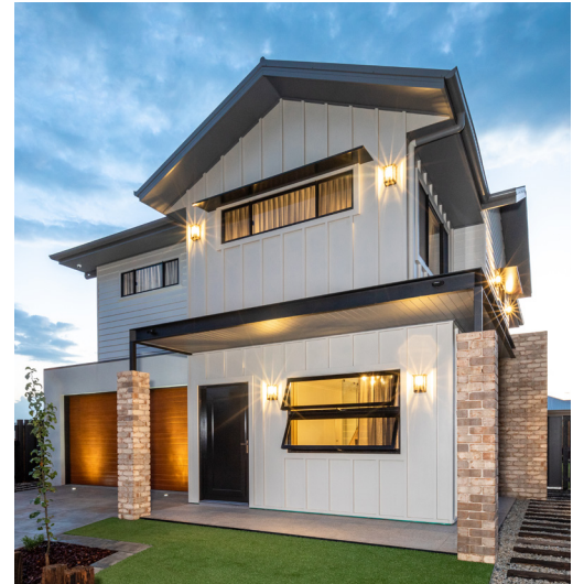
Quality designed homes

The Avenues of Highfields community will have over 500 lots to choose from over the lifetime of the development. It will set a new standard in urban design not only for Highfields but also for Toowoomba. Design standards for housing that will make each street part of a grand plan to be proud of. Where houses are the predominant feature not your garage, with attractive parks and tree lined streets.