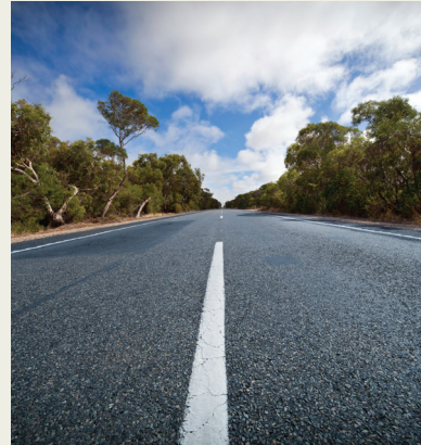
New infrastructure projects

Toowoomba as a regional centre, remains the powerhouse to South West Queensland and Northern New South Wales thriving industries. In fact, the Regional Australian Institute recently predicted that the Toowoomba and Surat Basin regions' gross regional product will increase by $10 billion in the next 15 years. The opportunities for employment are broad based - agriculture, mining, tourism, defense and health services provide a bright future for employment.