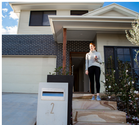
A place to call home