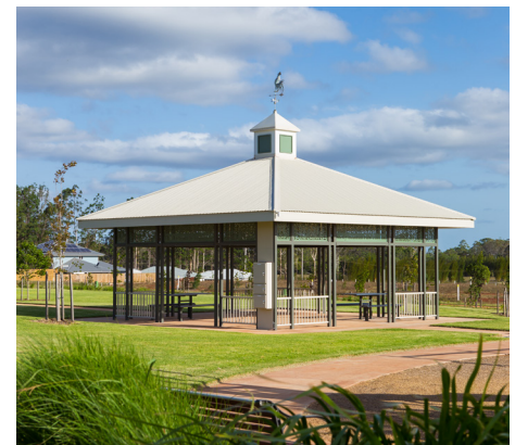
Beautiful scenic parks