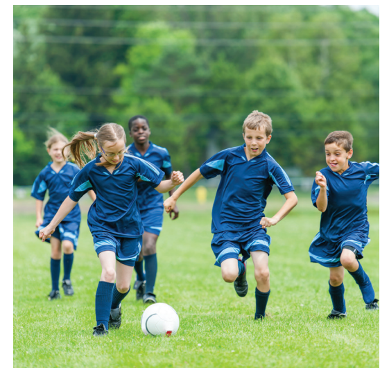
Local sporting grounds