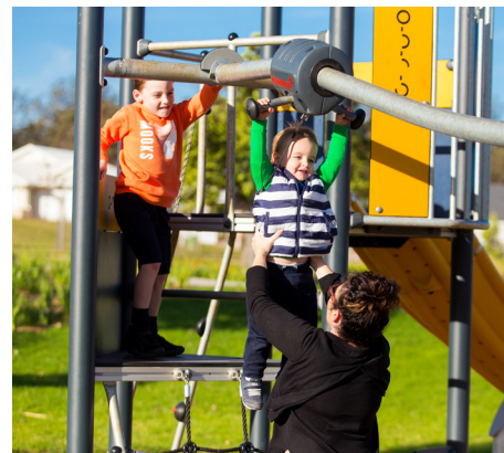
Love the lifestyle