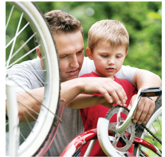
Things to enjoy