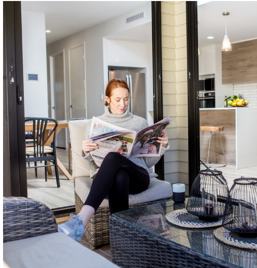
A great place to invest

The Avenues of Highfields value design, our builders will be hand picked and the homes will be cleverly designed, yet pay homage to all that's great about the style of housing that Toowoomba is known for.