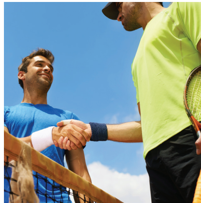
Access to sporting grounds

Highfields families are spoilt for choice in education. Great local State, Catholic and independent Primary Schools are within easy reach. Highfields State Secondary College, opened in January 2015, completed as part of the newly designed High School Program being rolled out by the State Government. This college is only a short walk from The Avenues.