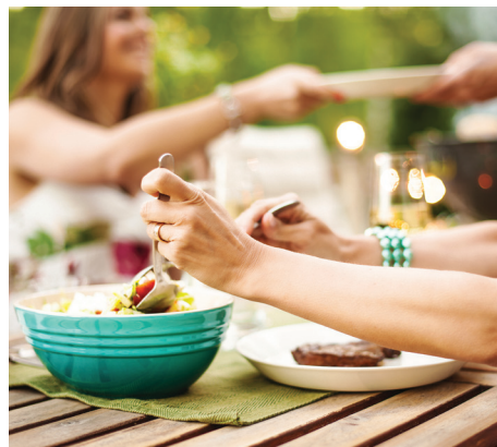
Relax & unwind