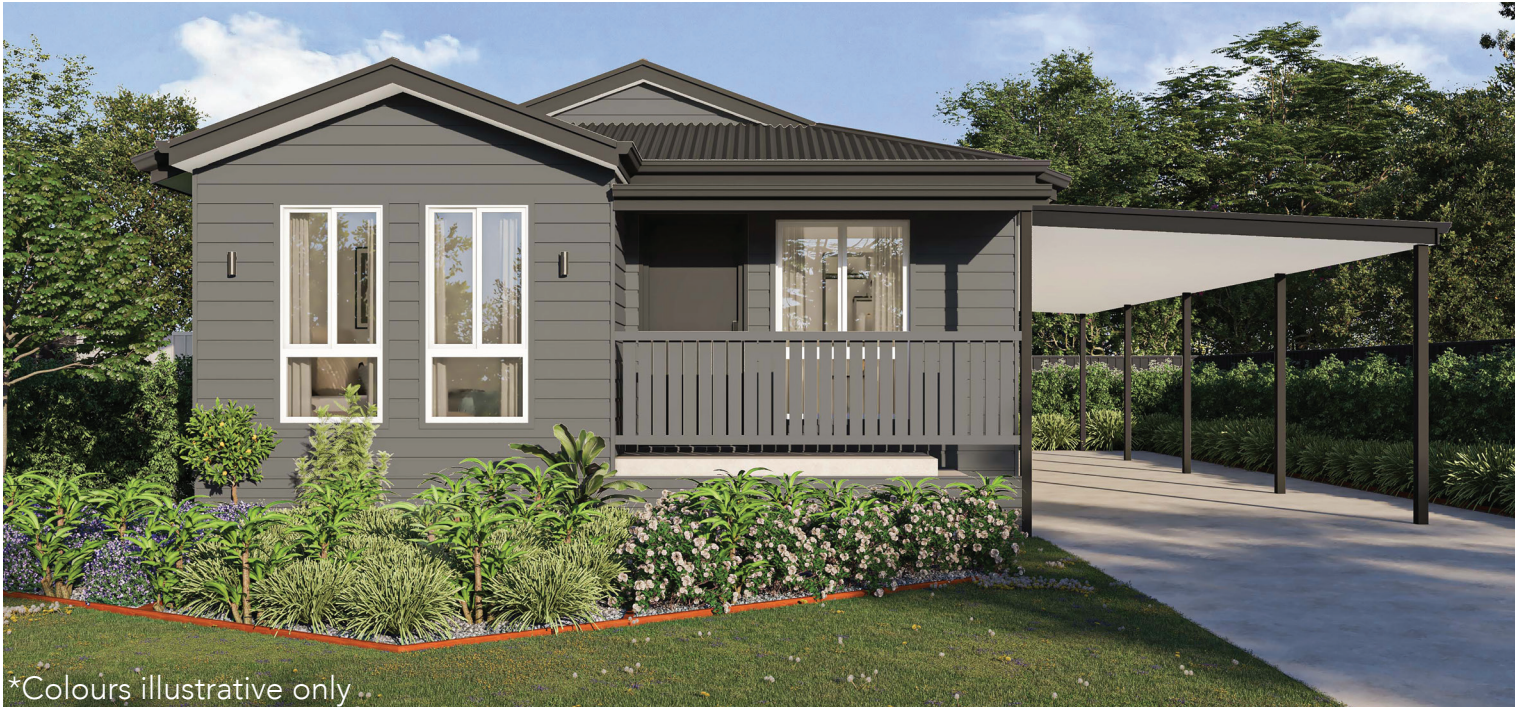
*Colours illustrative only