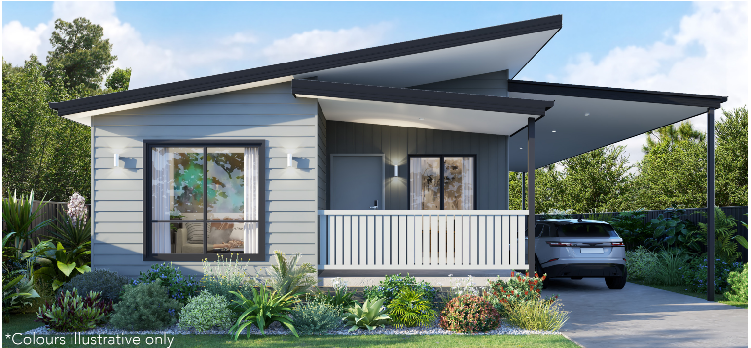
*Colours illustrative only