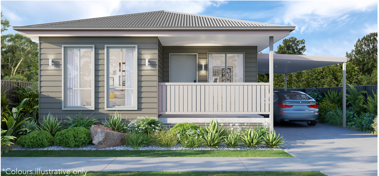
*Colours illustrative only